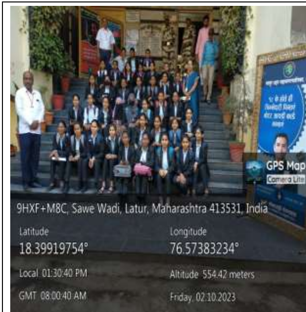
Students and Staff visit MCL