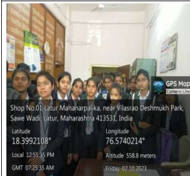
Students Interaction with the Property Department