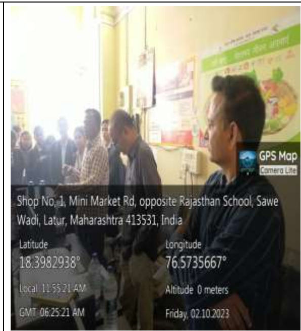
Students and Staff Interaction with Nagar Nirman Officers